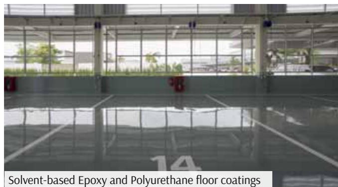
Solvent-based Epoxy and Polyurethane floor coatings