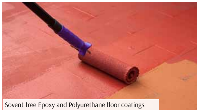
Solvent-free Epoxy and Polyurethane floor coatings